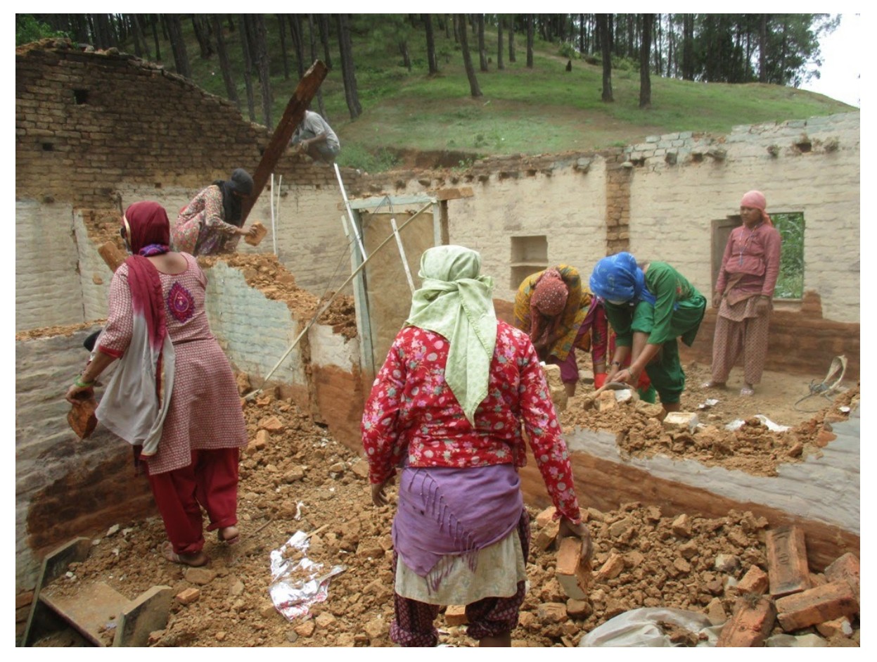
In the wake of the 2015 earthquake, Tewa volunteers dismantle damaged houses in Jharuwarasi, Lalitpur.

Sixth, building resilience shows the importance of breaking stereotypes of gender roles. Nepal is a patriarchal society and most of the caregiver work has to be done by women; but post-earthquake, women were going to dismantle houses, constructing buildings, and taking on work traditionally considered 'male'.