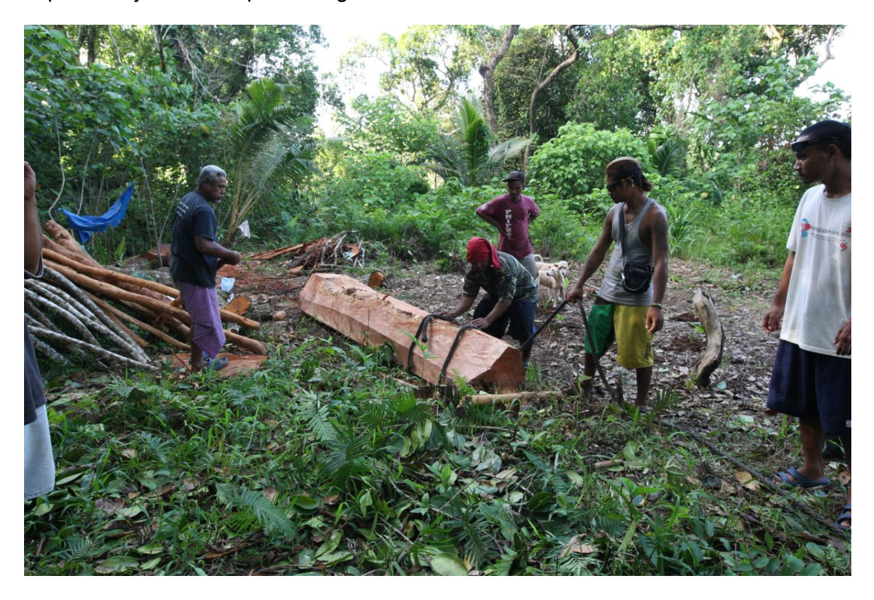
A community in Micronesia's most remote outer islands uses traditional knowledge to convert trees felled by a storm into canoes.

A second example comes from Global Greengrants' work in the Pacific Islands: Waa'gey is a community-based organization that works with both elders and youths to use trees felled by storms as an opportunity to teach traditional canoe-building. The Pacific Islands are hit by typhoons with ever increasing severity due to climate change; and often it is community-based actors like Waa'gey who are the first – and sometimes the only – frontline responders. With this work, they are not only cleaning up after a climate disaster, but also transferring indigenous knowledge from one generation to the next. For the community, turning the fallen trees into canoes is an important symbol of hope coming out of a time of destruction.